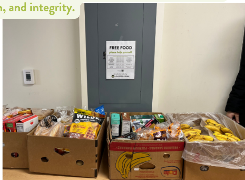
HFR Food boxes in an employee locker room at JHMR