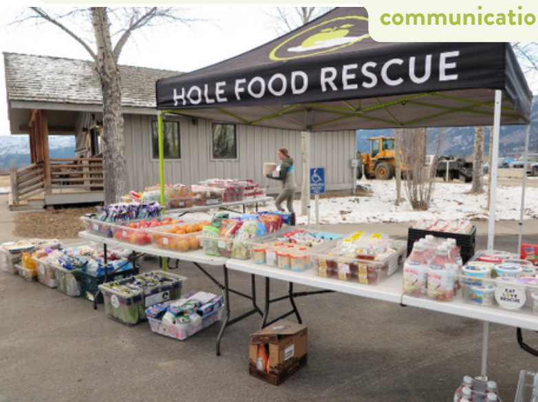
Food for the Community // Comida de la Comunidad POP-UP

We value our relationships. We create an inclusive community. We believe in collaboration, communication, and integrity.